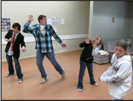
Students in the theatre workshop

The leaves are changing to multi yellows and reds as I wake up in the morning to frost on the grass here in Northern British Columbia. As I start this newsletter I am in Smithers, BC. This is my third visit to Smithers, here by invitation from a partnership between YWAM Smithers and the Salvation Army to help with the Salvation Army Food Drive. I performed at community services two nights,