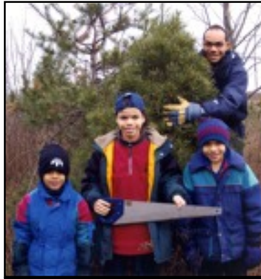
2002 Tree hunting