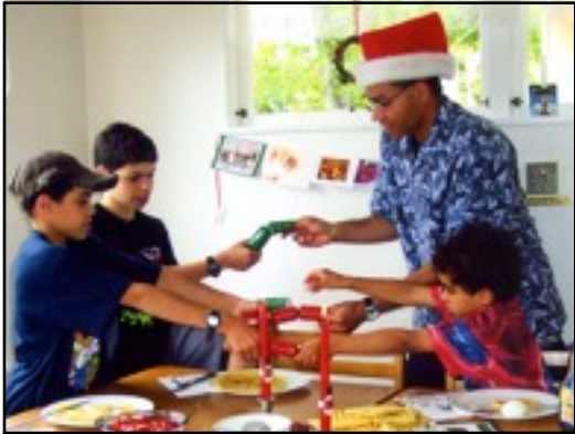
2004 Christmas in the summer NZ style