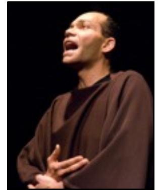
Emmanuel - The Christmas Chronicles

"Stories are the most prominent biblical way of helping us see ourselves in "the God story," which always gets around to the story of God making and saving us. Stories, in contrast to abstract statements of truth, tease us into becoming participants in what is being said. We find ourselves involved in the action. We may start out as spectators or critics, but if the story is good (and the biblical stories are very good!), we find ourselves no longer just listening to but inhabiting the story."