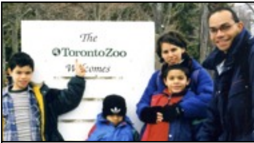
2002 Boxing day visit to the zoo