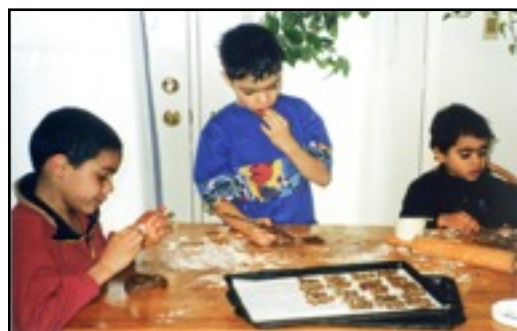
2001 The boys helping with the baking