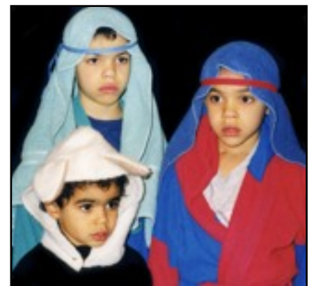
2001 Our three wise men