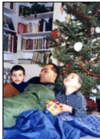
1998 The Wason boys tradition of sleeping under the tree